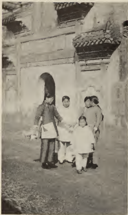
Group of school-girls in front of the temple of the Goddess of Mercy

help in the emancipation of their country. They have brains but need directing power and careful schooling if they are to take their place in the new world opening up before them.